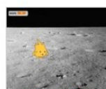
Hide and Seek